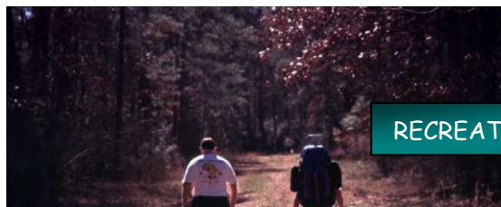
RECREATION AND AESTHETICS