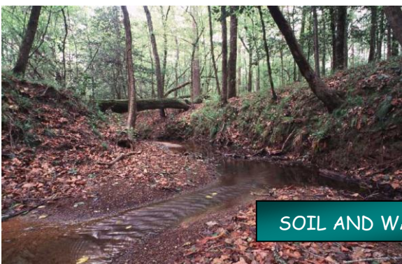
SOIL AND WATER