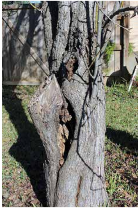
Many broken branches or severe topping