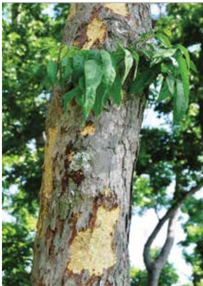
Soapberry borer infestation