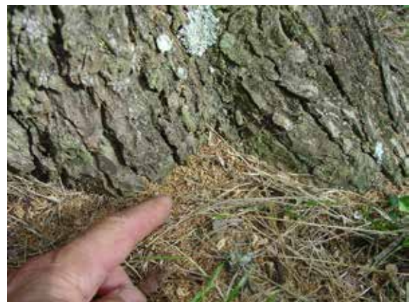
Boring dust in cedar elm