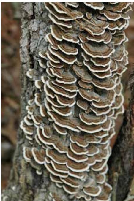
Mushrooms on trunk

Mushrooms or other fungi growing from trunk, branches or roots