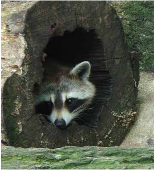
Cavities in trunks or branches