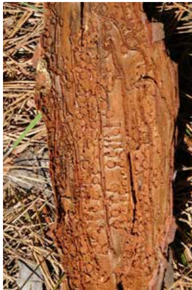
Engraver beetle galleries in loblolly pine bark