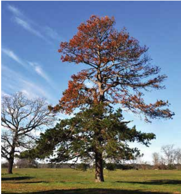
Pine attacked by engraver beetles