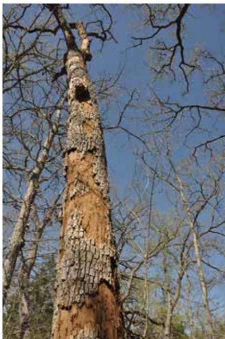
Brown fungus is Hypoxylon canker