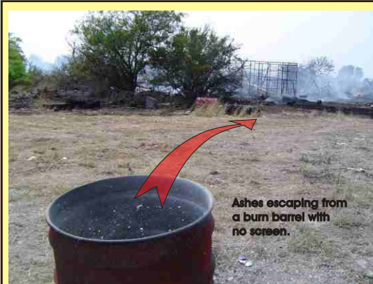
Ashes escaping from a burn barrel with no screen.

In Texas, 90% of all wildfires are human-caused; escaped debris burning is the number one cause of those wildfires.