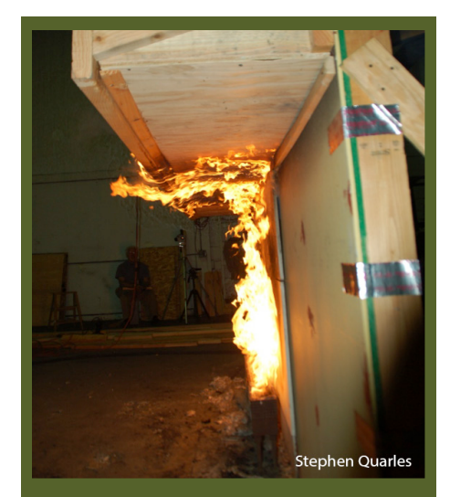
Lateral flame spread was reduced when a combustible soffit material ignited in this test of a soffited-eave with a combustible soffit material.