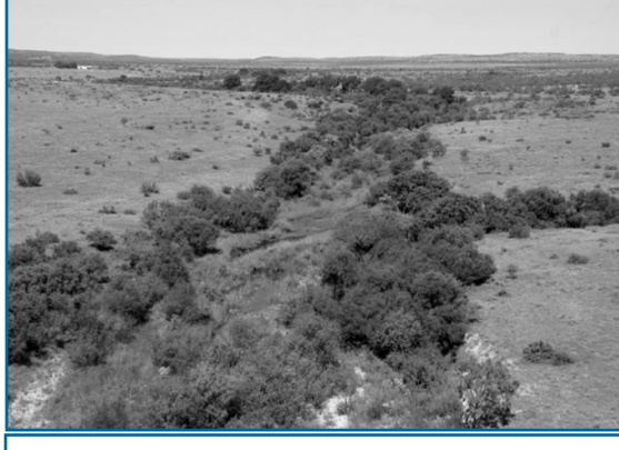
Riparian area buffer zones reduce the amount of sediment that enters streams. They also benefit wildlife by providing food, cover, travel corridors, and nesting sites.

Texas A&M Forest Service, in cooperation with Texas State Soil and Water Conservation Board and numerous natural resource partners, develops and periodically updates BMP guidelines, and provides education, outreach, and training on their application.